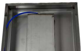
Keyhole fixings at top rear of unit.

Clean unit with warm soapy water and a cloth or stiff bristle brush. Further cleaning should be regularly undertaken with soapy water only. Chemical cleaners are not required or advised.